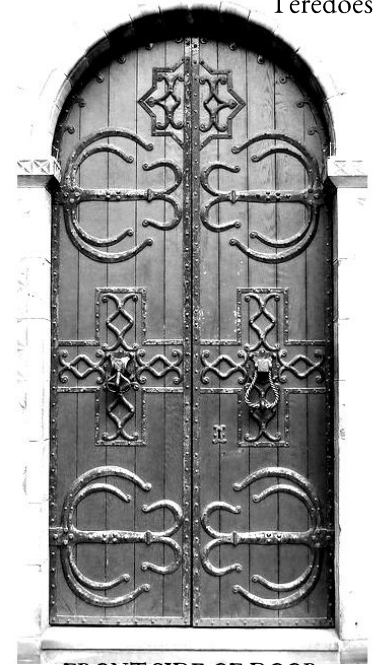
FRONT SIDE OF DOOR

The Teredo in the left door is ferrophile. It dug tunnels to lick at iron nails and ornaments. The right Teredo feels the opposite way. Januaries avoid and worship the Teredoes.