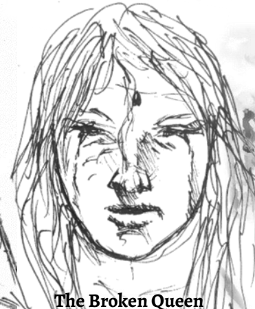
The Broken Queen