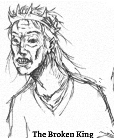
The Broken King